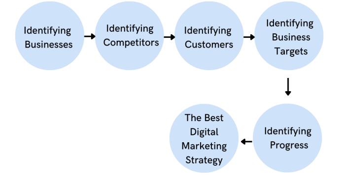
Figure 1. Stages of Determining the Best Strategy

The research approach employed was descriptive research, which is a type of research targeted at characterizing currently occurring phenomena [16]. Descriptive research strives to create a methodical, factual, and accurate picture of a study object's facts and features [16]. It can be decided to implement a digital marketing strategy based on the analysis of the two characteristics above, with the stages of determining the best strategy and the initial step of laying the digital foundation in the form of identifying businesses, competitors, customers, business targets, and progress [17].